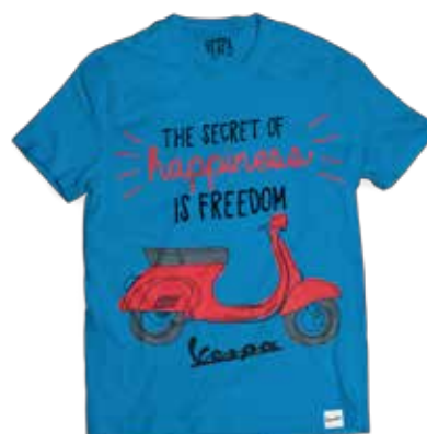
VPSI33 (2-3y) VPSI34 (3-5y)