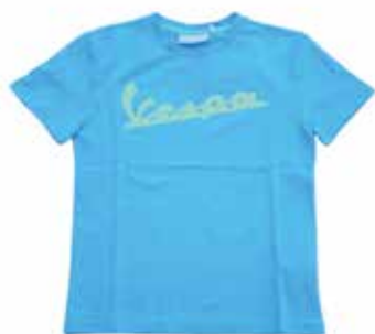
VPTU16 (S - 5/6 Y) - VPTU17 (M - 7/8 Y) - VPTU18 (L - 9/10 Y)