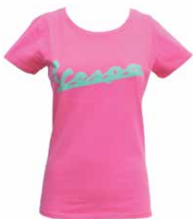
VPTU01 (S) - VPTU02 (M) VPTU03 (L) - VPTU04 (XL)