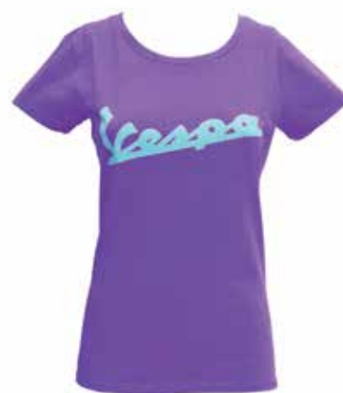
VPTU11 (S) - VPTU12 (M) VPTU13 (L) - VPTU14 (XL)