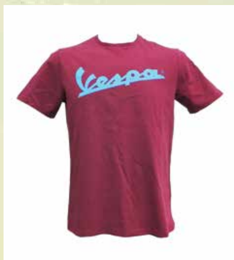
VPTU35 (S) - VPTU36 (M) VPTU37 (L) - VPTU38 (XL)