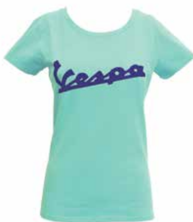
VPTU06 (S) - VPTU07 (M) VPTU08 (L) - VPTU09 (XL)