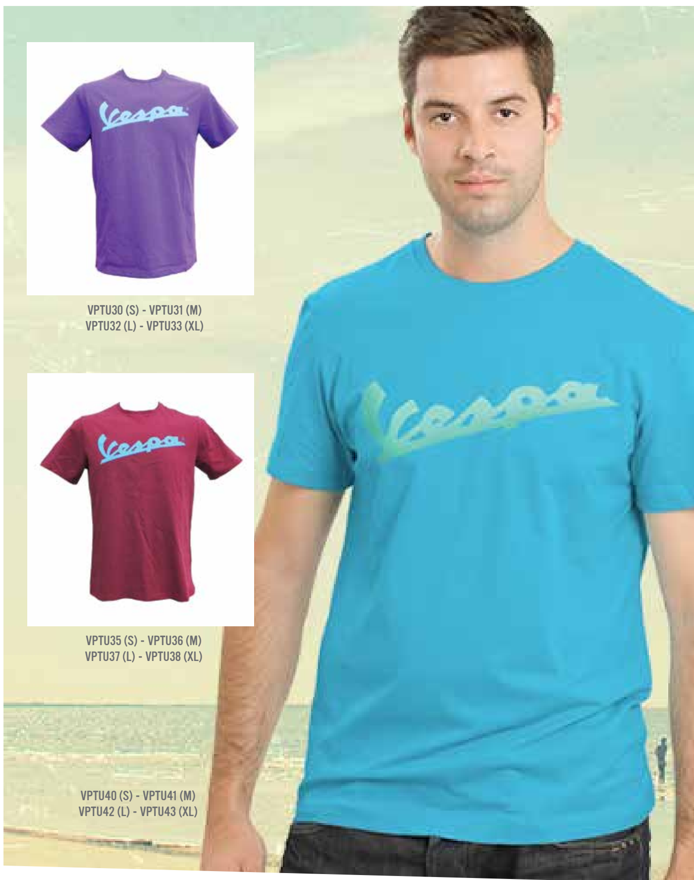
VPTU40 (S) - VPTU41 (M) VPTU42 (L) - VPTU43 (XL)