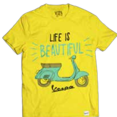
VPSI31 (2-3y) VPSI32 (3-5y)