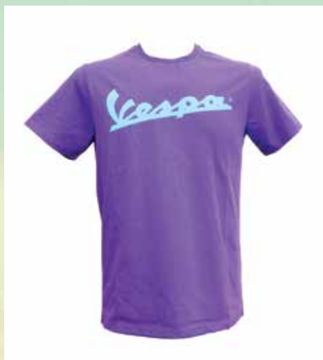
VPTU30 (S) - VPTU31 (M) VPTU32 (L) - VPTU33 (XL)