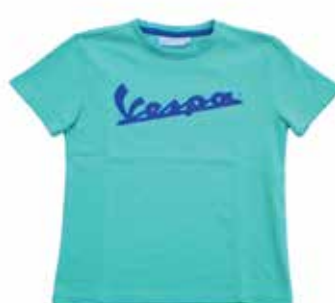
VPTU21 (S - 5/6 Y) - VPTU22 (M - 7/8 Y) - VPTU23 (L - 9/10 Y)